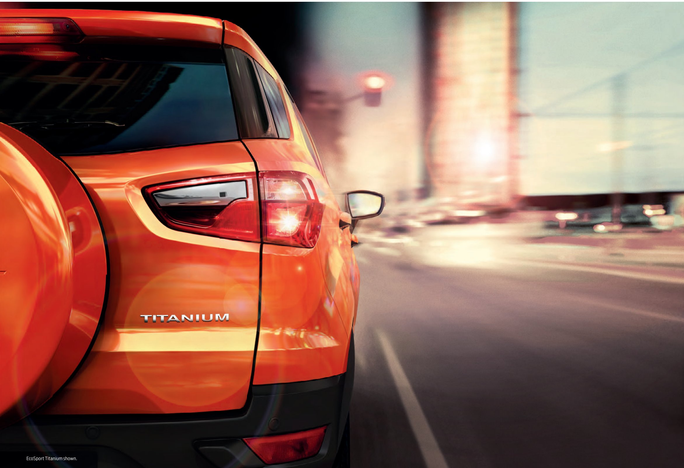
EcoSport Titanium shown.

The EcoSport is engineered to give you more of what you need, and less of what you don't. That means giving you more kilometres per tank, without compromising on responsive power. So you spend less time at the pump and more time on the road.