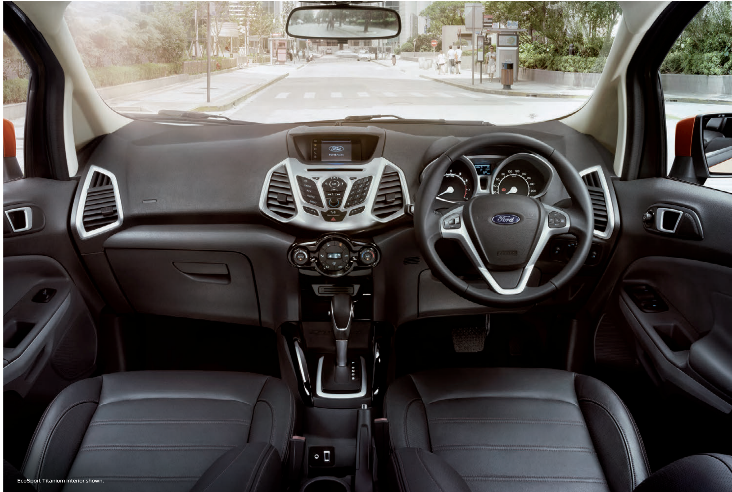
EcoSport Titanium interior shown.

Inside its rugged exterior, the EcoSport has a softer side. An interior that has exactly the smart, intuitive technology you need, and a touch of luxury, to help make your life run effortlessly.