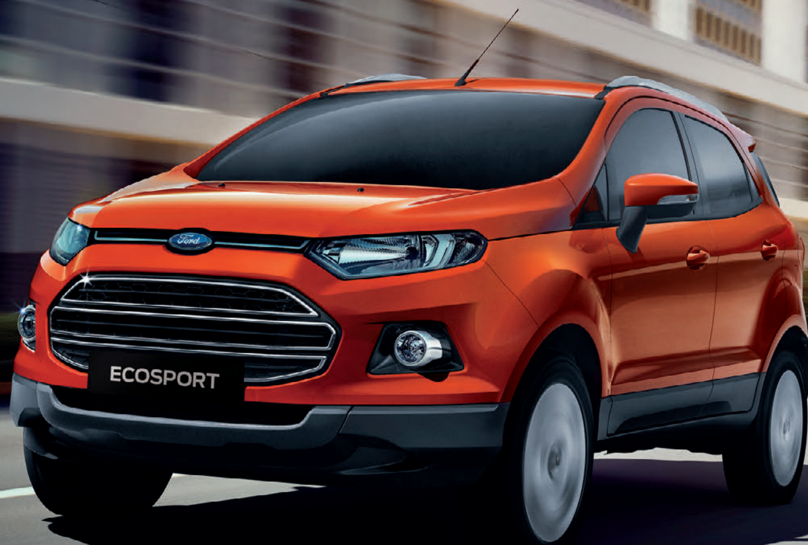
EcoSport Titanium shown.

The city can serve up plenty of challenges — potholes, narrow laneways, rough surfaces, you name it. That's why the EcoSport sits 200mm off the ground so you can tackle all of those challenges with confidence. And with its impressive power, sporty design and confidently stylish finishes, you'll be turning heads for all the right reasons.