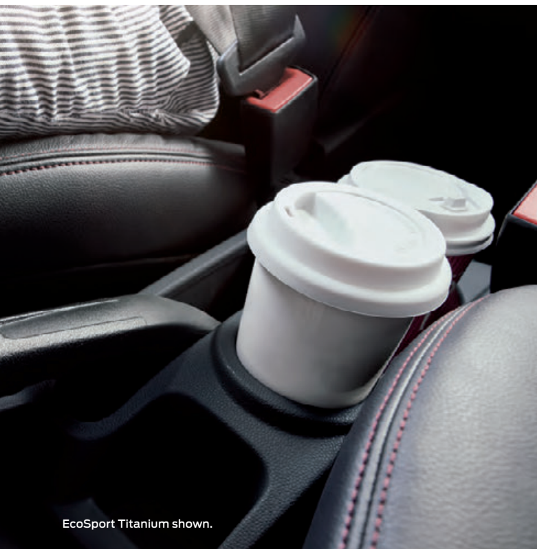
EcoSport Titanium shown.