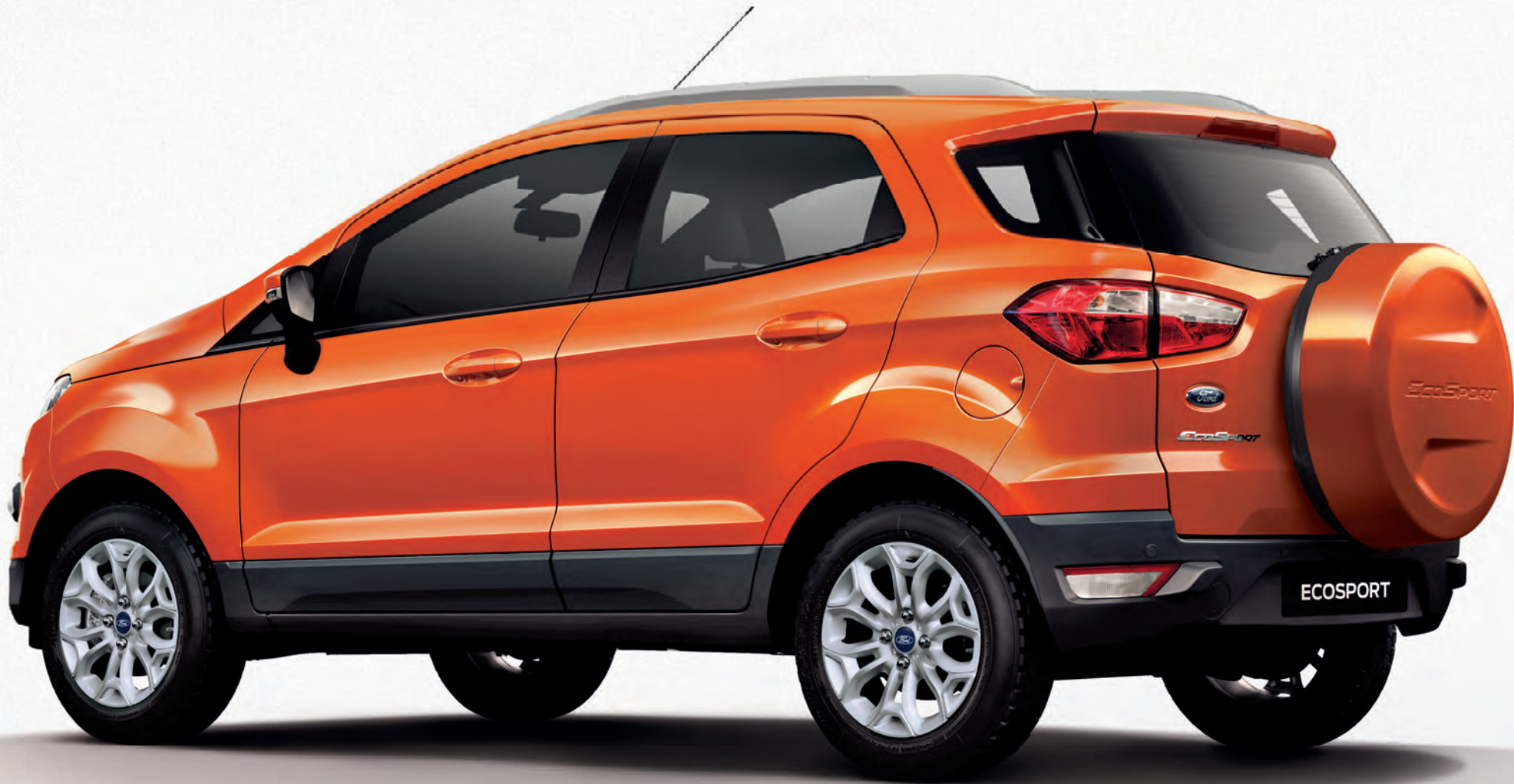
EcoSport Titanium shown.