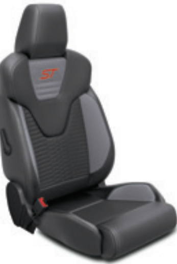
Trim for Moondust Silver and Stealth

The choice is yours The Ford Vehicle Personalisation accessory range lets you personalise your Focus to perfectly suit your needs.