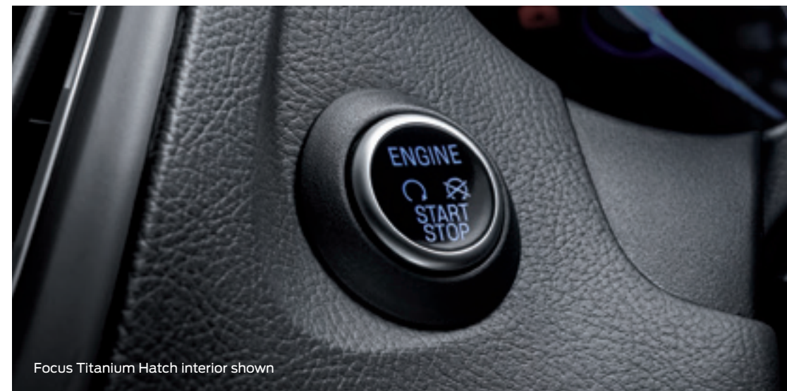
Focus Titanium Hatch interior shown