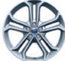
19" alloy wheel 5-spoke

Alloy wheels A range of distinctive alloy wheels purpose-designed to complement Focus' dynamic lines.