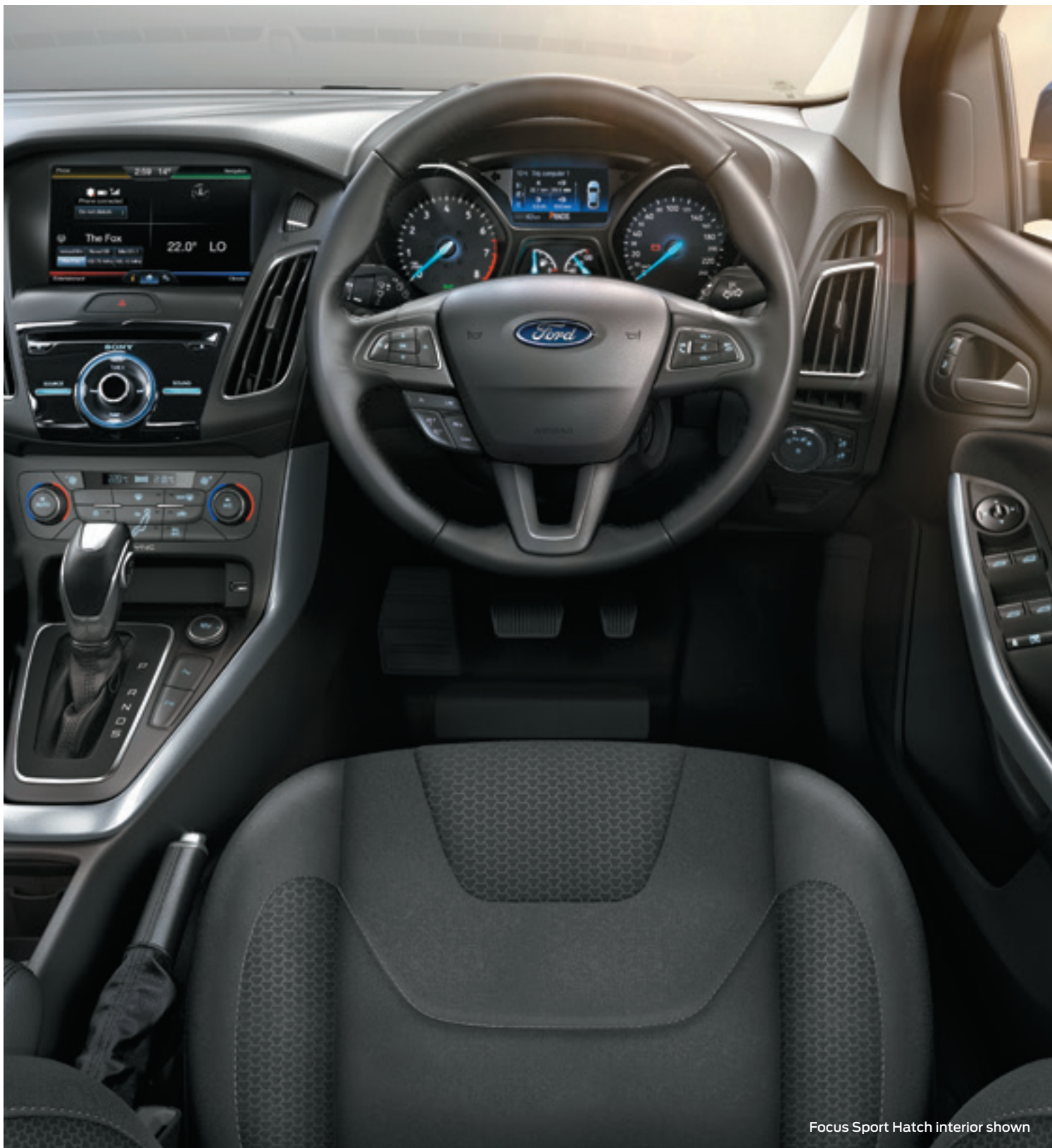
Focus Sport Hatch interior shown