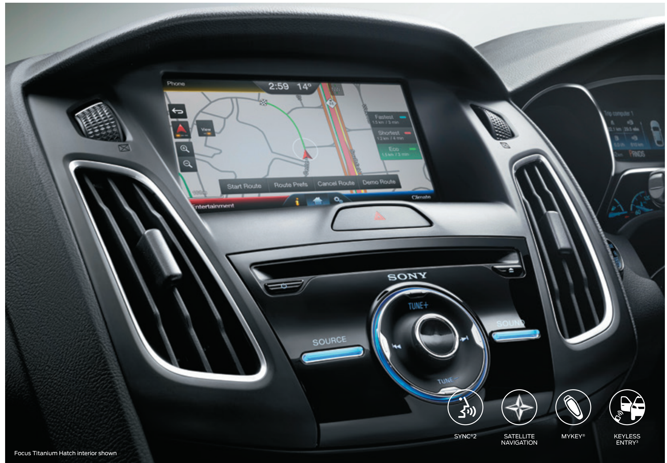
Focus Titanium Hatch interior shown

1. Depending on your mobile phone. 2. Bluetooth ® is a registered trademark of Bluetooth SIG Inc. and is used under licence. 3. Available on Sport, Titanium & ST models only.