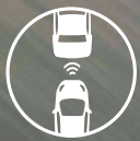
ACTIVE CITY STOP 1,2,3