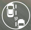
BLIND SPOT INFORMATION SYSTEM 1,3