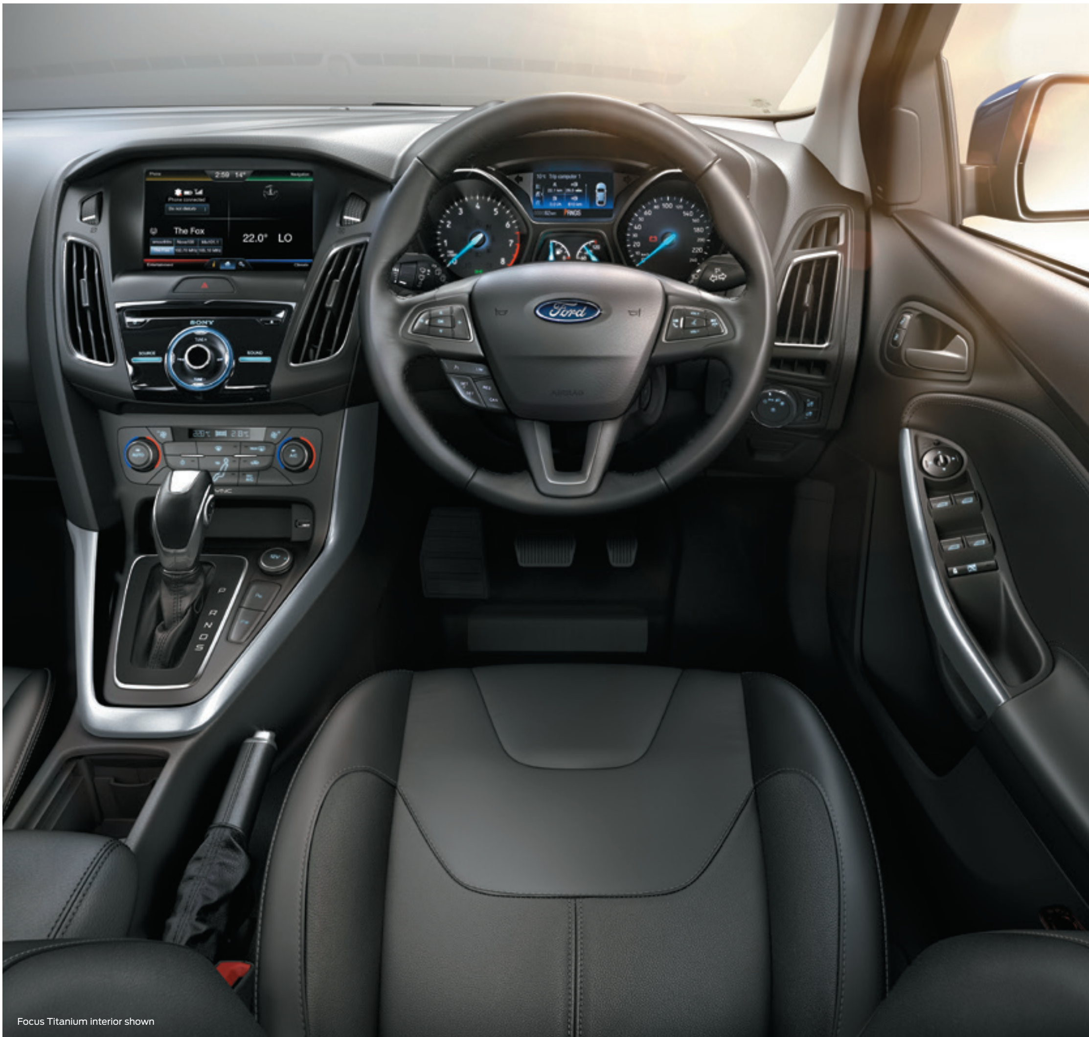
Focus Titanium interior shown