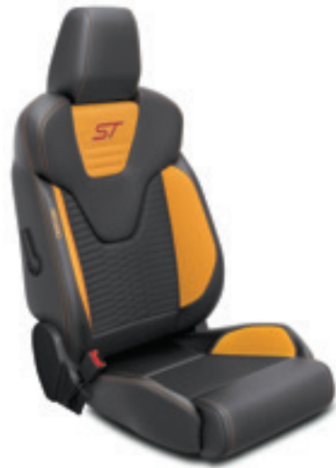
Trim for Tangerine Scream

Titanium Seat Insert and bolster: Torino leather in Charcoal Black