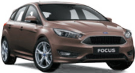
Lunar Sky 1