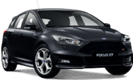
Shadow Black 4