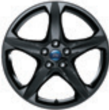
18" alloy wheel 5-spoke, Panther Black