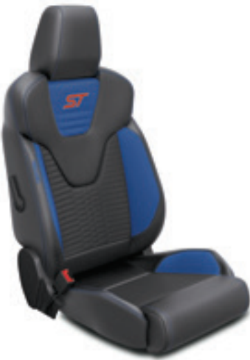
Trim for Frozen White and Spirit Blue