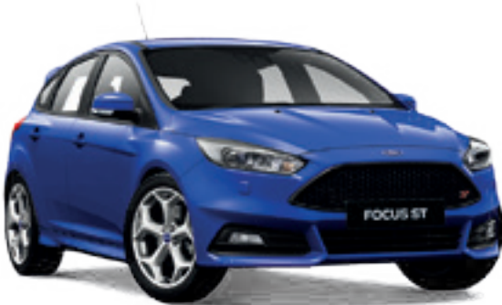
Deep Impact Blue