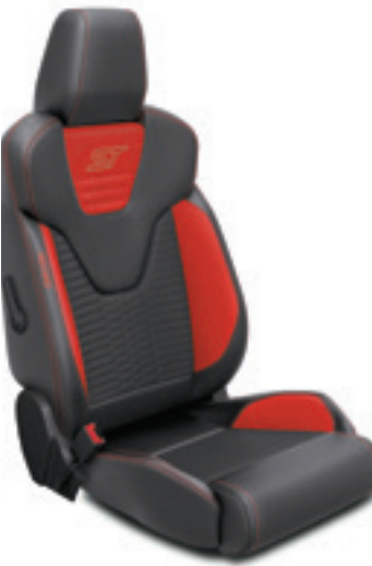
Trim for Race Red and Panther Black