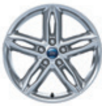
17" x 7" alloy wheel

S = Standard. A = Accessory that can be added at any time.