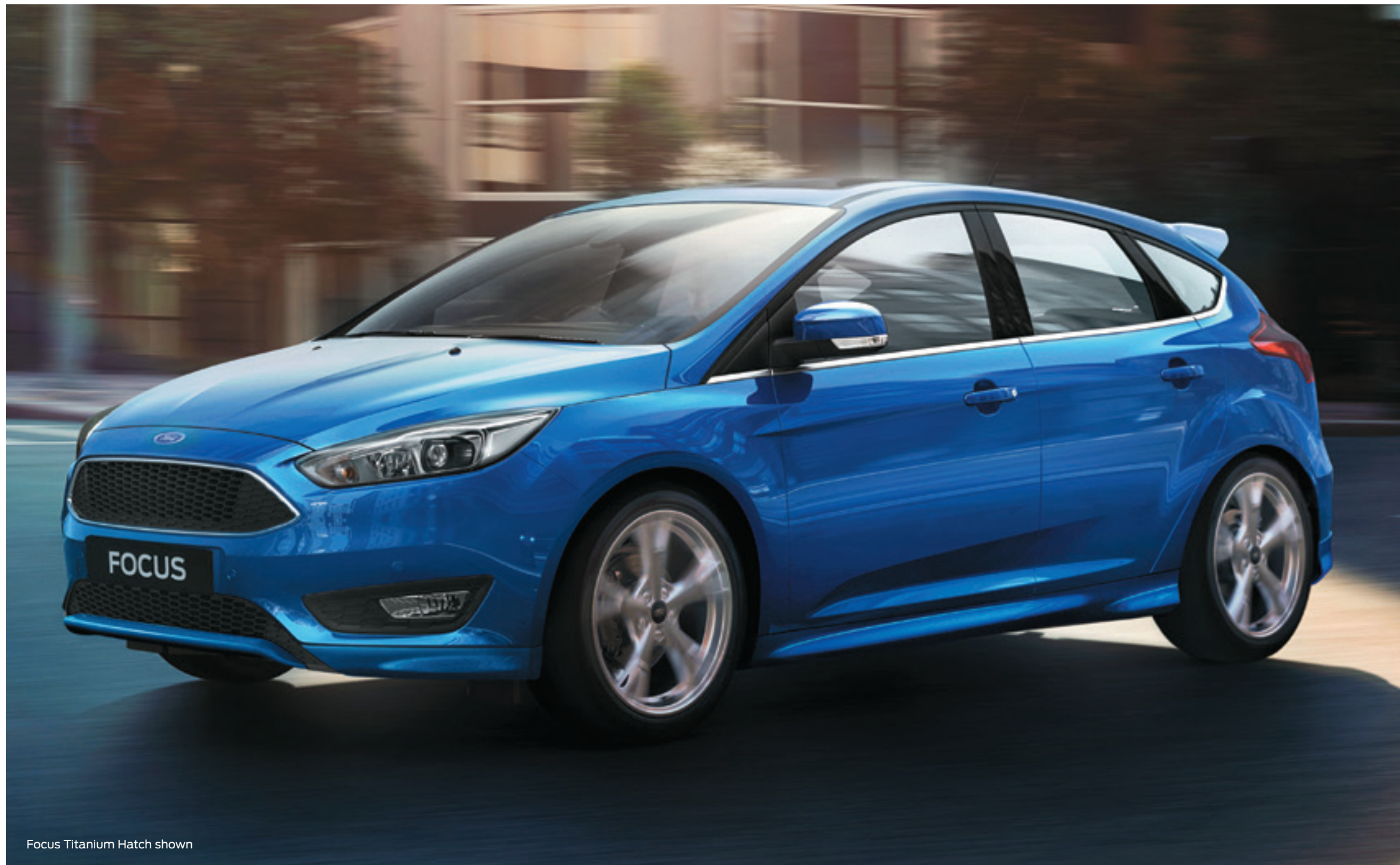
Focus Titanium Hatch shown