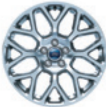
18" alloy wheel 8-spoke