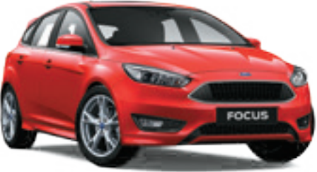
Race Red 2