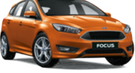
Tiger Eye 3