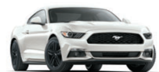
White Platinum 1, 2