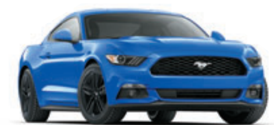
Grabber Blue 2