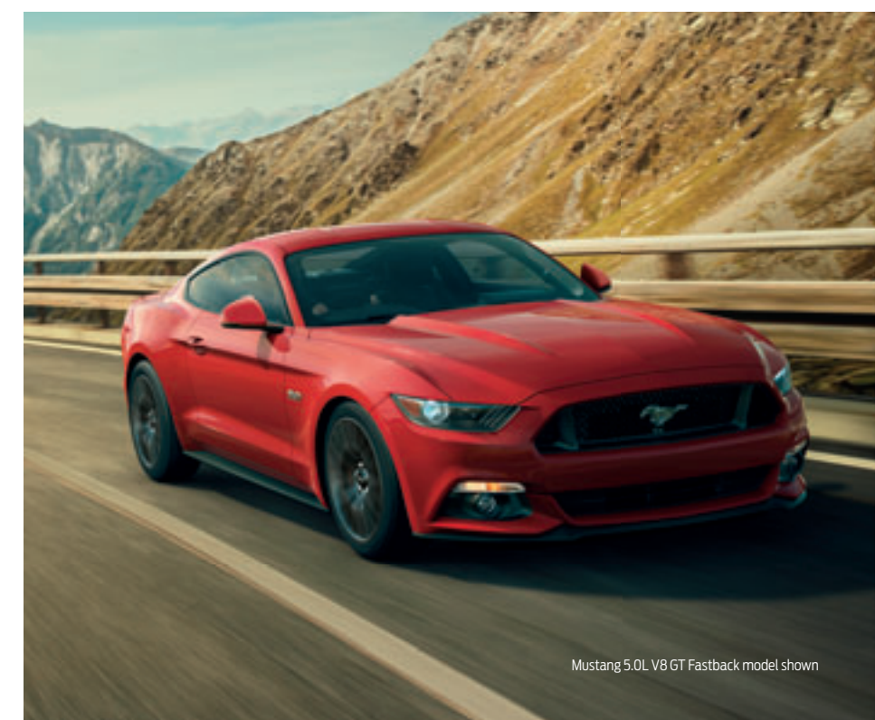
Mustang 5.0L V8 GT Fastback model shown