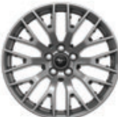
Optional 5.0L V8 19" alloy wheels with Lustre Nickel finish 1