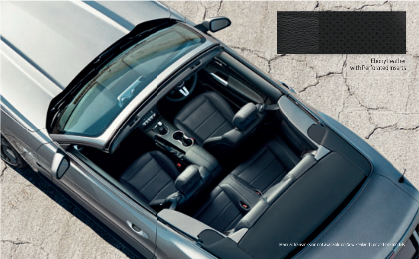
Ebony Leather with Perforated Inserts

Manual transmission not available on New Zealand Convertible models.