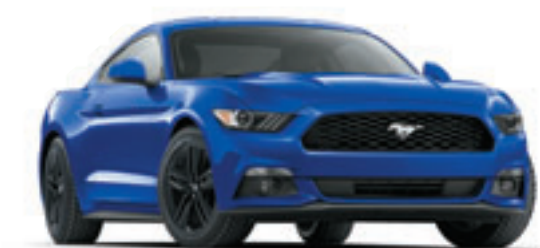
Lightning Blue 2