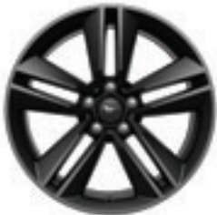
Standard with 2.3L EcoBoost 19" alloy wheels