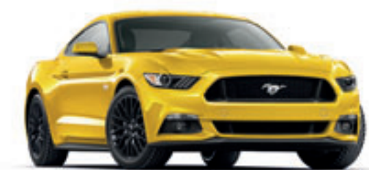
Triple Yellow 1