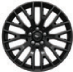
Standard with 5.0L V8 19" alloy wheels